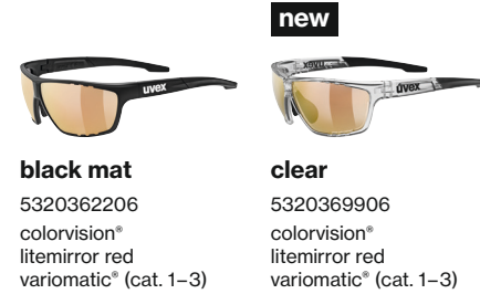
black mat 5320362206 colorvision® litemirror red variomatic® (cat. 1-3)