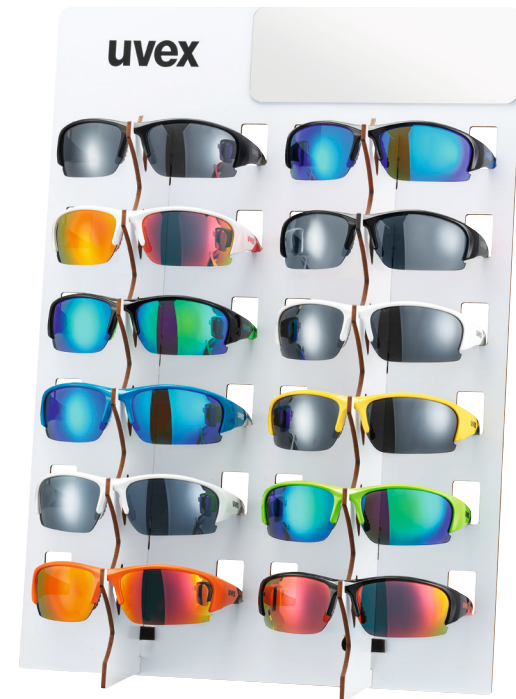
set//with display 5308849990