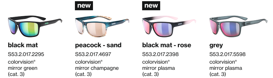
black mat S53.2.017.2295 colorvision® mirror green (cat. 3)