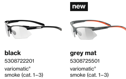
black 5308722201 variomatic® smoke (cat. 1-3)