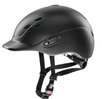
black mat 4354610104 // 3xs-xs