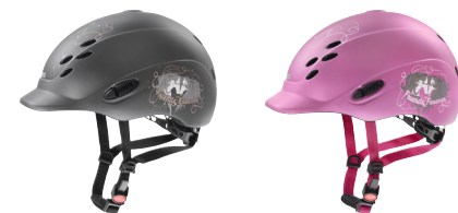
friends II anthracite mat 4354621004 // 3xs-xs