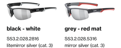
black - white S53.2.028.2816 litemirror silver (cat. 3)