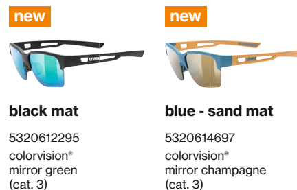
new black mat 5320612295 colorvision® mirror green (cat. 3)