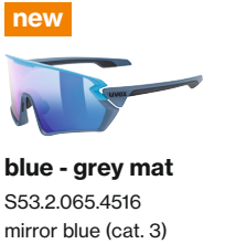
blue - grey mat S53.2.065.4516 mirror blue (cat. 3)