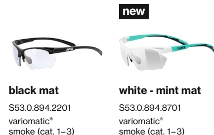
black mat S53.0.894.2201 variomatic® smoke (cat. 1-3)